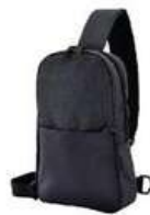
SLING BAG S04-322SLB-21