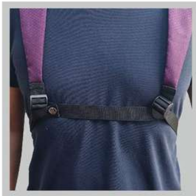
Shoulder strap end doubles as sternum strap.