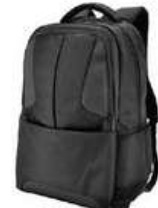
LAPTOP BACKPACK S02-693LAP-01