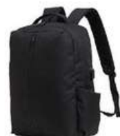
LAPTOP BACKPACK S02-1606LAP-01