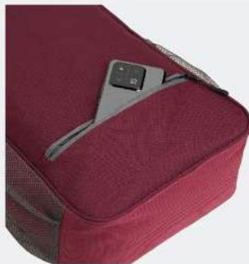
Horizontal front pocket for easy access on the go.