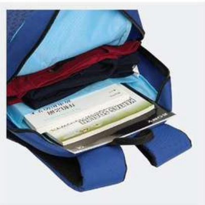
Main compartment with document sleeve.