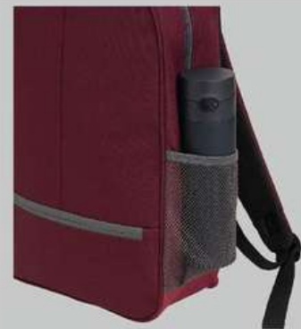
Two water bottle pockets on both sides of bag.