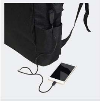
External USB charging port.