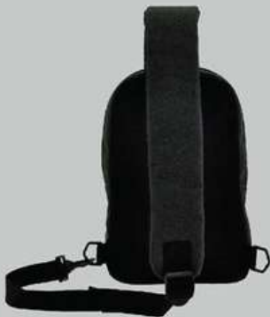
Padded shoulder strap & back support.