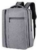
CONVERTIBLE LAPTOP BACKPACK S02-1677CON-01 S02-1677CON-07