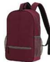
DAYPACK S02-1637STD-02 S02-1637STD-09