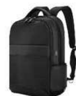
LAPTOP BACKPACK S02-1175LAP-01