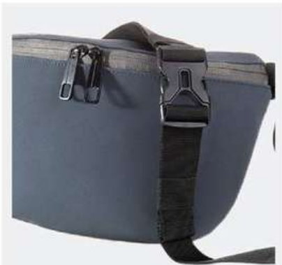
Sleeve organiser on straps keeps things tidy.