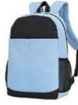
DAYPACK S02-569STD-12 S02-569STD-16