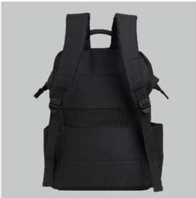
Padded shoulder straps & back panel for all-day carry.