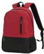
DAYPACK S02-1626STD-09 S02-1626STD-21