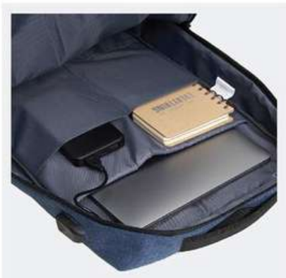
Multiple internal pockets to organize your things.