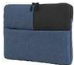
LAPTOP SLEEVE S06-1625LAP-02 S06-1625LAP-07