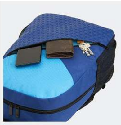
Front pocket for easy access on the go.