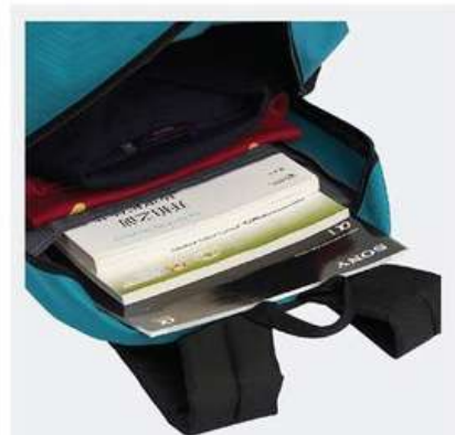
Main compartment with document sleeve.