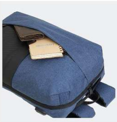
Vertical hidden front pocket for easy access.