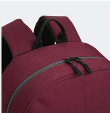
Webbing carry handle at the top.