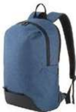
DAYPACK S02-1389STD-02 S02-1389STD-21