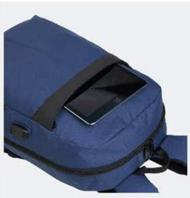
Horizontal front pocket for easy access on the go.