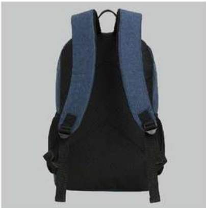
Padded shoulder straps for all-day carry.