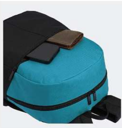
Horizontal front pocket for easy access on the go.