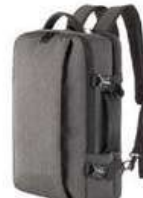
LAPTOP BACKPACK S02-1371LAP-21