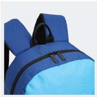
Webbing carry handle at the top.