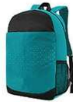
DAYPACK S02-569STD-03 S02-569STD-13