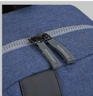
Zip pullers with webbing tape.