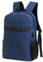
LAPTOP BACKPACK S02-1621LAP-01 S02-1621LAP-02