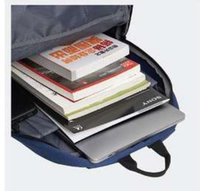
Padded laptop sleeve for devices up to 15\"/>