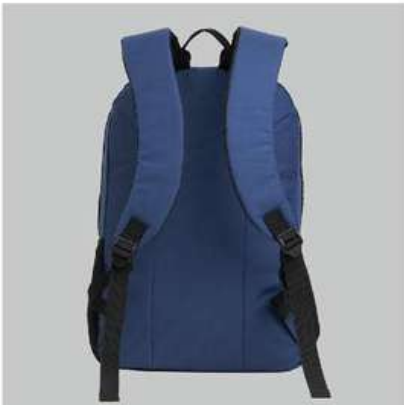
Padded shoulder straps & back panel for all-day carry.