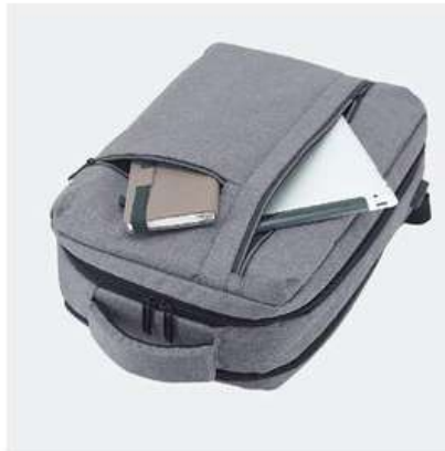
Two front pockets for easy access on the go.