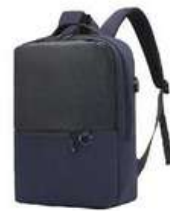
LAPTOP BACKPACK S02-1676LAP-01 S02-1676LAP-02