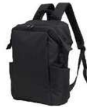
LAPTOP BACKPACK S02-1622LAP-01