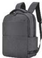
LAPTOP BACKPACK S02-587LAP-21