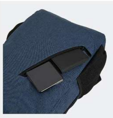
Front pocket for easy access on the go.