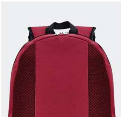
Two-way zip opening into main compartment.