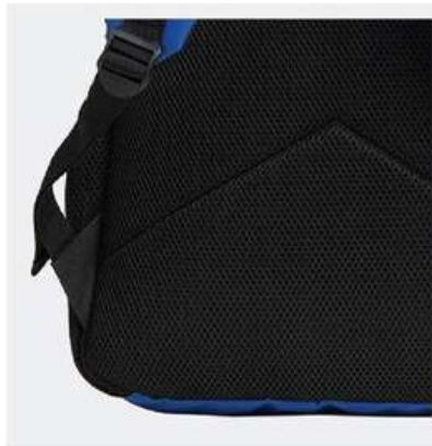
Mesh back panel for comfort.