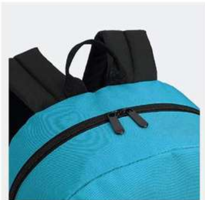
Webbing carry handle at the top.