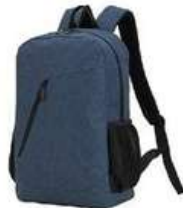
DAYPACK S02-1640STD-02 S02-1640STD-21