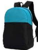
DAYPACK S02-1645STD-13 S02-1645STD-23