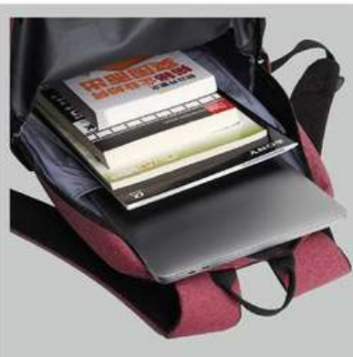
Padded laptop sleeve for devices up to 15".