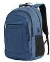
LAPTOP BACKPACK S02-1632LAP-01 S02-1632LAP-02 S02-1632LAP-07