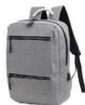
LAPTOP BACKPACK S02-1631LAP-01 S02-1631LAP-02 S02-1631LAP-07