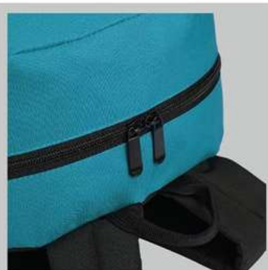
Two-way zip opening into main compartment.