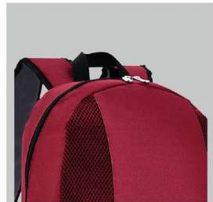
Webbing carry handle at the top.