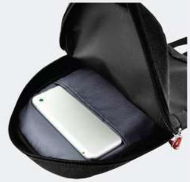
Inner pocket to fit tablet size up to 9".