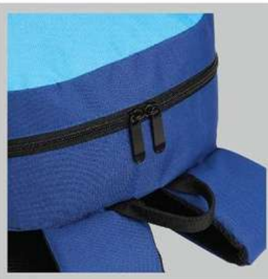
Two-way zip opening into main compartment.