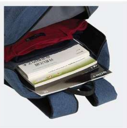
Main compartment with document sleeve.