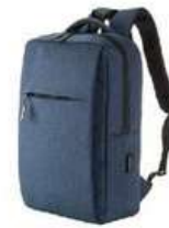
LAPTOP BACKPACK S02-1370LAP-02