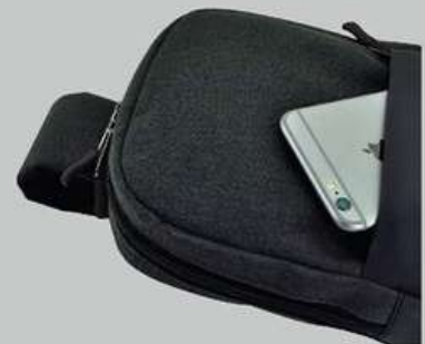
Front pocket for easy access on the go.