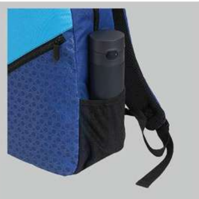
Two water bottle pockets on both sides of bag.