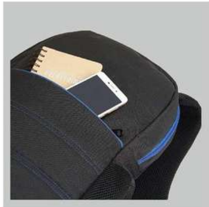
Horizontal front pocket for easy access on the go.