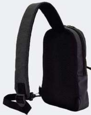
Mesh back panel.