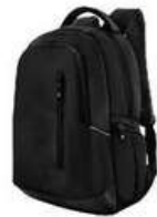
LAPTOP BACKPACK S02-1147LAP-01