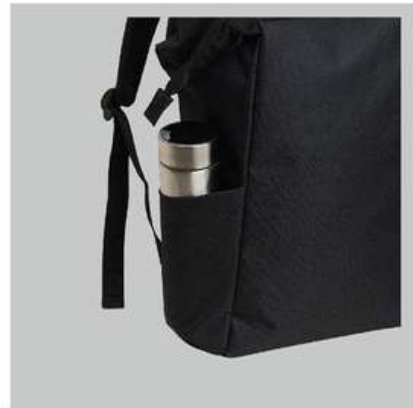
Two water bottle pockets on both sides of bag.