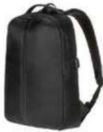
LAPTOP BACKPACK S02-1382LAP-01