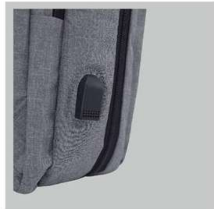
External USB charging port.