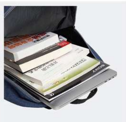
Padded laptop sleeve for devices up to 15".