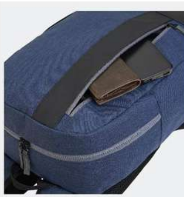
Vertical front pocket for easy access on the go.