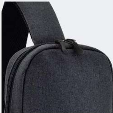
Two zipper head opening for easy access.