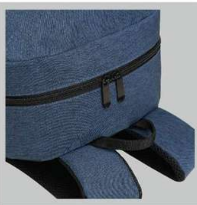
Two-way zip opening into main compartment.