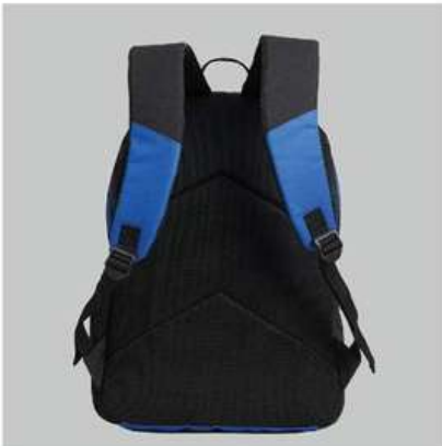
Padded shoulder straps for all-day carry.