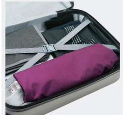
Packs easily into luggage.