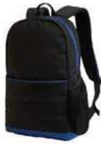
LAPTOP BACKPACK S02-1609LAP-05 S02-1609LAP-07 S02-1609LAP-15