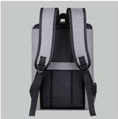
Padded shoulder straps & back panel for all-day carry.