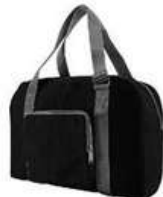
FOLDABLE TRAVEL BAG S05-1673FOL-01 S05-1673FOL-13 S05-1673FOL-23