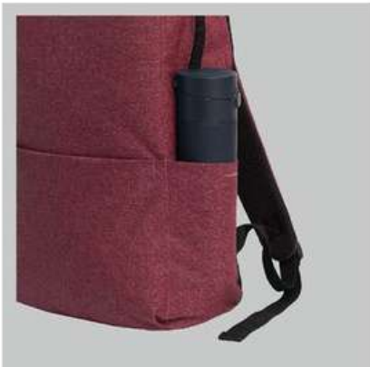
Water bottle pockets on both sides of bag.