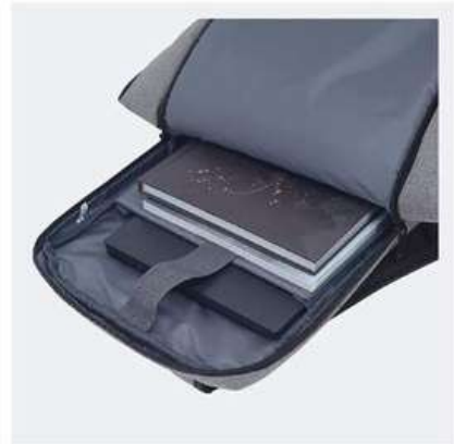
Secondary section with padded laptop sleeve for devices up to 15".