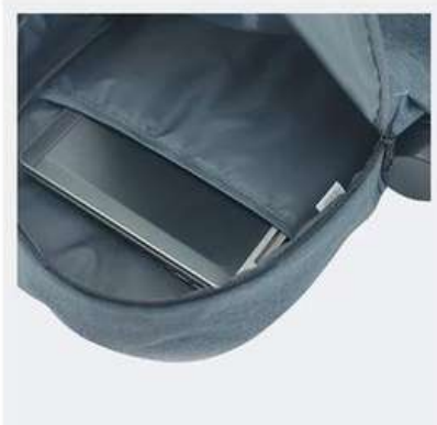
Padded laptop sleeve for devices up to 15".