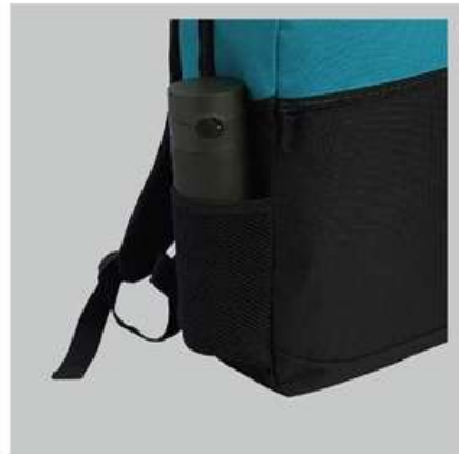
Mesh water bottle pocket on exterior.