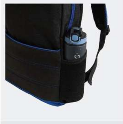
Mesh water bottle pocket on exterior.