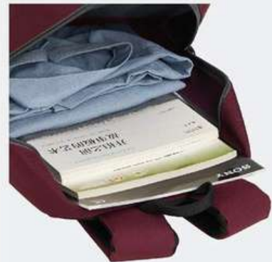
Main compartment with document sleeve.