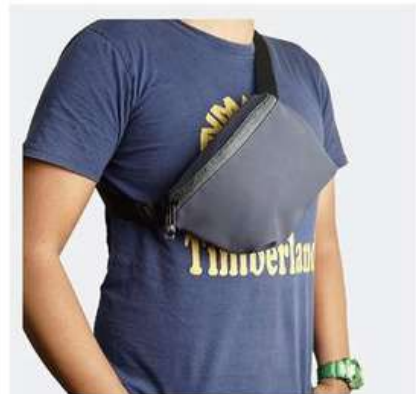
Can be carried as a waist pouch or cross body.