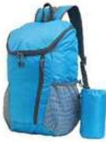
FOLDABLE BAG S02-1600FOL-01 S02-1600FOL-12 S02-1600FOL-21