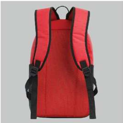
Padded shoulder straps for all-day carry.