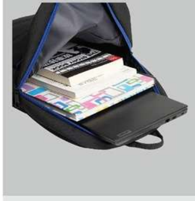
Padded laptop sleeve for devices up to 15\"/>