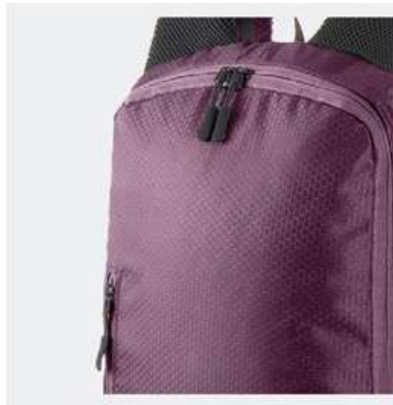
Anti-theft security with bag opening from the rear.