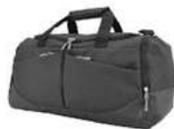
TRAVEL BAG S05-394STD-21