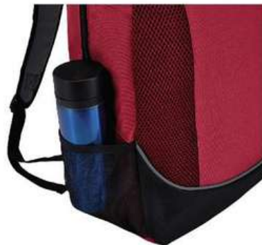
Two mesh water bottle pockets on both sides of bag.