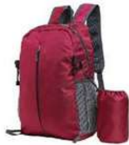
FOLDABLE BAG S02-1601FOL-02 S02-1601FOL-09 S02-1601FOL-13