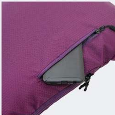
Back pocket for easy access to valuables.