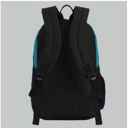
Padded shoulder straps for all-day carry.