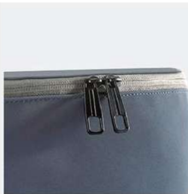
Equipped with two zipper heads for easy access.