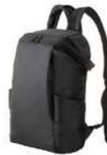
LAPTOP BACKPACK S02-1380LAP-01