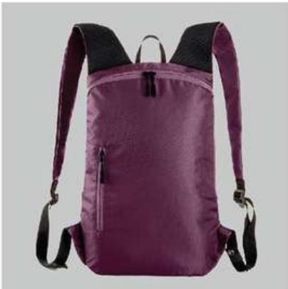
Padded shoulder straps for all-day carry.