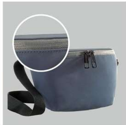
Reverse coil zipper for increased security.