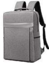
LAPTOP BACKPACK S02-1675LAP-01 S02-1675LAP-02 S02-1675LAP-07