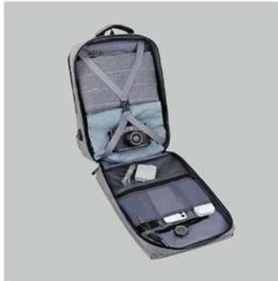
Main compartment for both clothing and personal essentials.