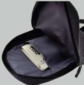
Spacious interior with organisation.