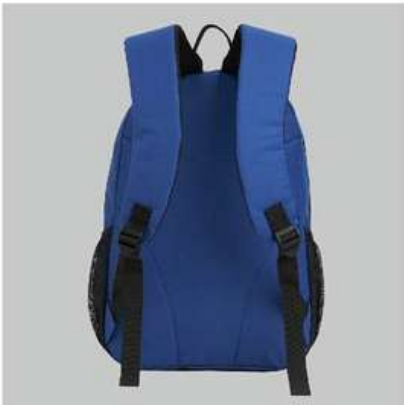
Padded shoulder straps for all-day carry.