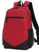
DAYPACK S02-1639STD-03 S02-1639STD-20