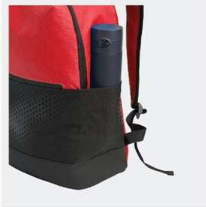
Two water bottle pockets on both sides of bag.