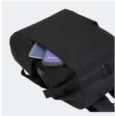
Vertical front pocket for easy access on the go.