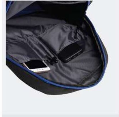
Multiple internal pockets to organize your things.