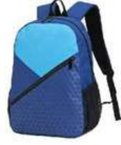
DAYPACK S02-1624STD-01 S02-1624STD-02