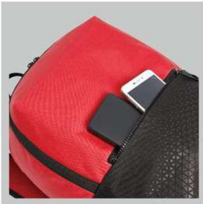
Horizontal front pocket for easy access on the go.