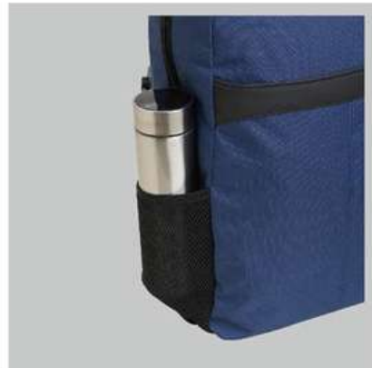
Two mesh water bottle pockets on both sides of bag.