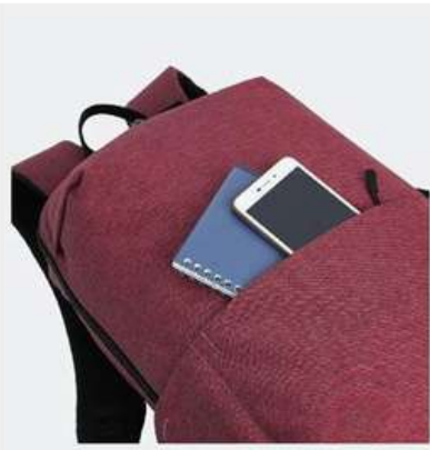
Horizontal front pocket for easy access on the go.