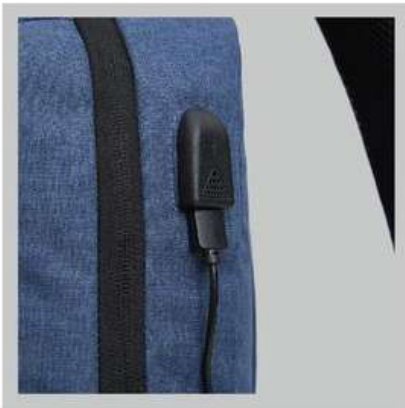
External USB charging port.