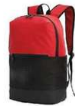
DAYPACK S02-1610STD-03 S02-1610STD-12