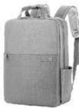
LAPTOP BACKPACK S02-1674LAP-01 S02-1674LAP-07