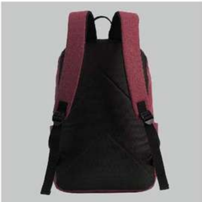
Padded shoulder straps & back support.