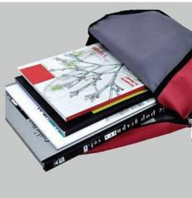
Main compartment with document sleeve.