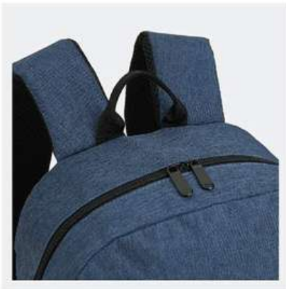
Webbing carry handle at the top.