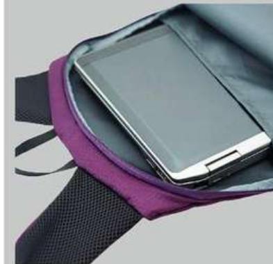
Laptop sleeve for devices up to 13".