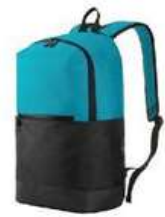
DAYPACK S02-1388STD-13 S02-1388STD-15