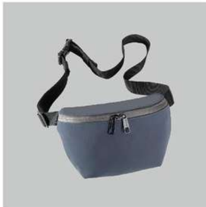
Soft Nylon webbing straps.