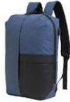
LAPTOP BACKPACK S02-1605LAP-07 S02-1605LAP-20