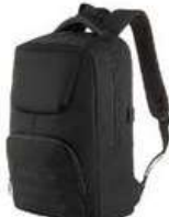
LAPTOP BACKPACK S02-1369LAP-01