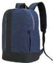
DAYPACK S02-1608STD-01 S02-1608STD-02