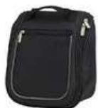
TOILETRY POUCH S04-1607TOI-01