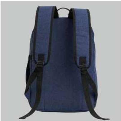
Padded shoulder straps & back panel for all-day carry.