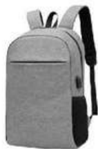
LAPTOP BACKPACK S02-1565LAP-01 S02-1565LAP-09 S02-1565LAP-21