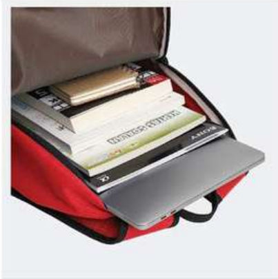
Padded laptop sleeve for devices up to 15".