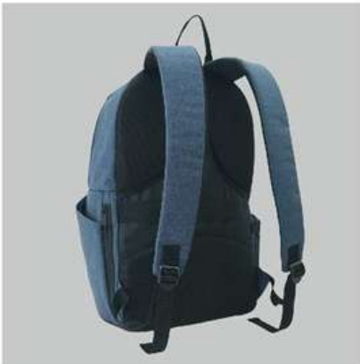
Padded shoulder straps & back panel for all-day carry.