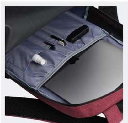
Multiple internal pockets to organize your things.