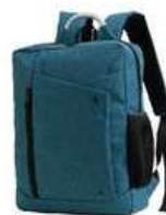
LAPTOP BACKPACK S02-1577LAP-01 S02-1577LAP-02 S02-1577LAP-13