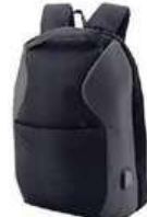
LAPTOP BACKPACK S02-1121LAP-01