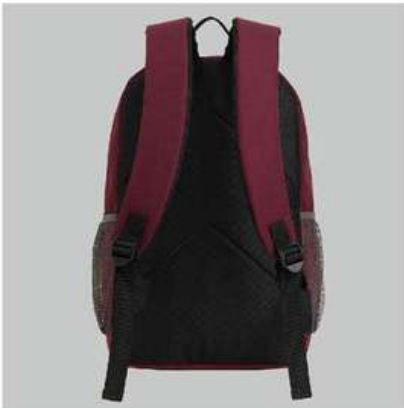
Padded shoulder straps for all-day carry.