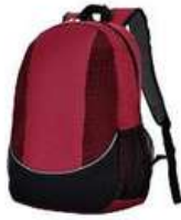
DAYPACK S02-500STD-02 S02-500STD-09