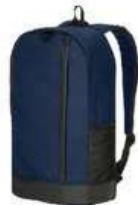
DAYPACK S02-1393STD-02 S02-1393STD-21