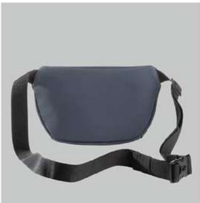
Minimalist & sleek design.