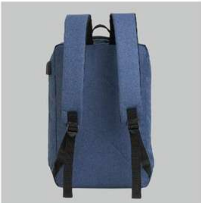
Padded shoulder straps & back panel for all-day carry.