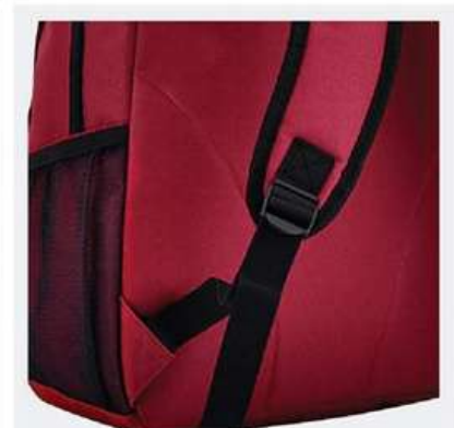
Adjustable shoulder straps.