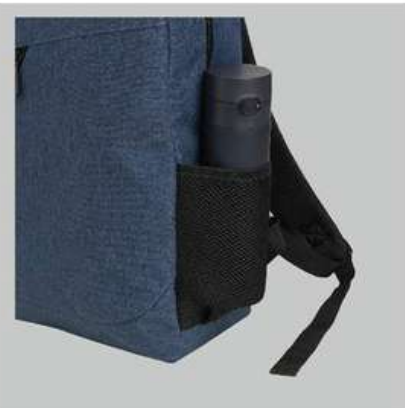
Two water bottle pockets on both sides of bag.