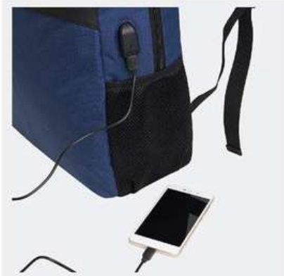
External USB charging port.