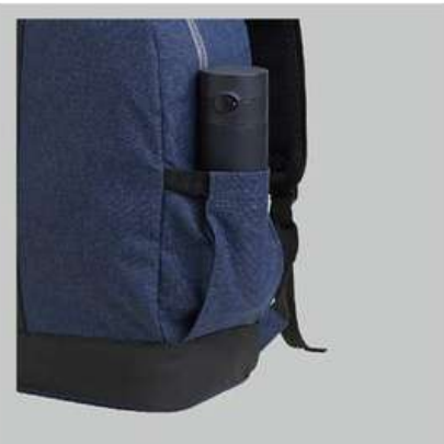
Water bottle pocket on exterior.