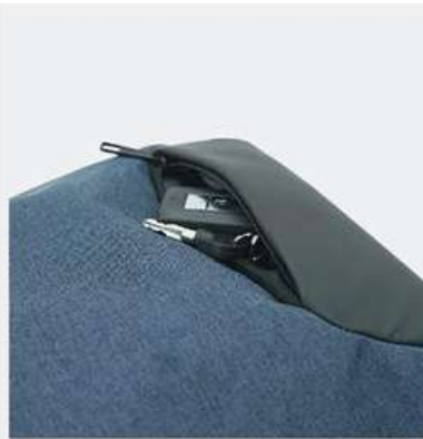
Vertical front pocket for easy access on the go.