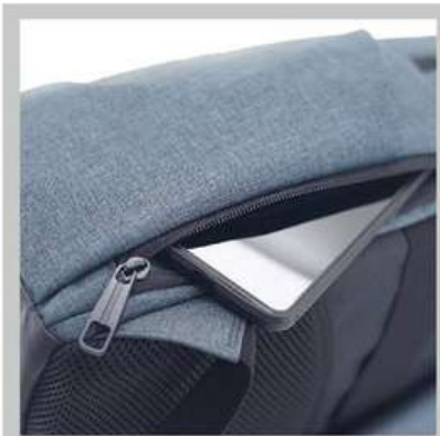
Hidden side pocket for valuables.