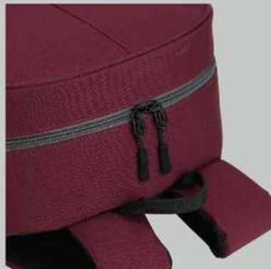
Two-way zip opening into main compartment.