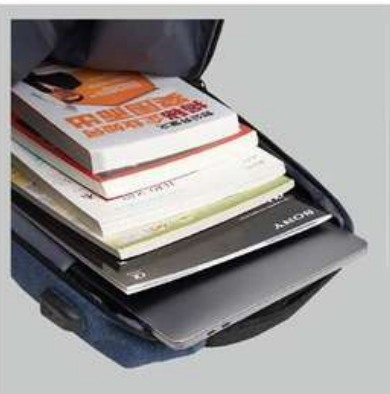
Padded laptop sleeve for devices up to 15".