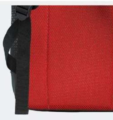
Mesh back panel for comfort.