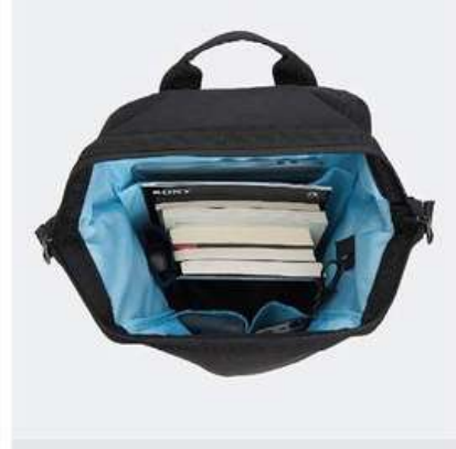
Main compartment equipped with a padded laptop sleeve & multiple internal pockets.