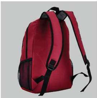
Padded shoulder straps for all-day carry.