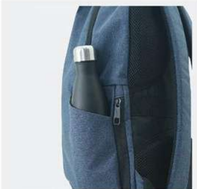
Two water bottle pockets on both sides of bag.