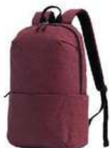
LAPTOP BACKPACK S02-1602LAP-20 S02-1602LAP-21 S02-1602LAP-23